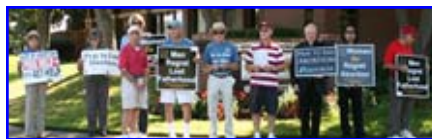
3rd Shift: 11 - 1