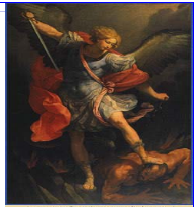
Archangel St. Michael by Guido Reni